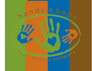
DO NOT USE: Transparent version of our logo with any other colors as a background