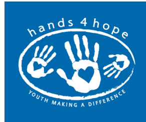
Image of white logo on our blue background